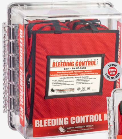
8 Pack Station