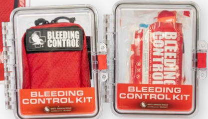
Individual Kit Station