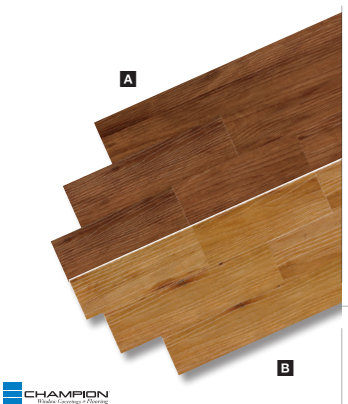
Champion® 6 x 36" Vinyl Plank Flooring ⚠ CA Residents, See Warning 1

A 127444 Gunstock Oak B 127448 Natural Oak