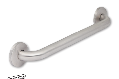
Maintenance Warehouse® 1-1/2 X 24" Concealed Mount Grab Bar 731223