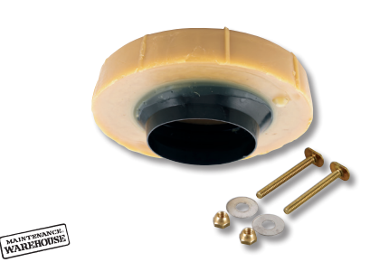
Maintenance Warehouse® Universal Toilet Wax Ring, Brass Bolts, Plastic Washers 569284