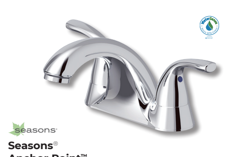
Seasons® Anchor Point™ Two-Handle Bath Faucet 158704