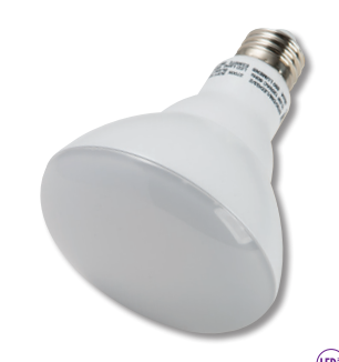
8 Watt LED BR-30 Dimmable (65W Equiv)

701143 2,700 Kelvin 701144 4,100 Kelvin 449214 3.000 Kelvin 449215 5,000 Kelvin