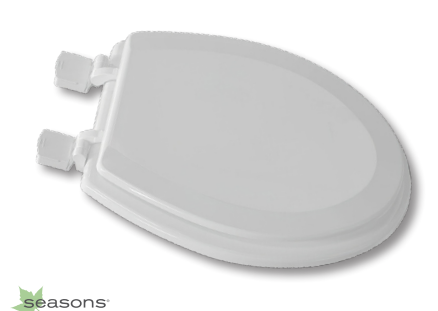
Seasons® Beveled Edge Round Wood Toilet Seat Case Of 6 214919