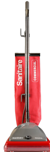
TRADITION® Upright Vacuum MFG # SC684G

Durable, lightweight TRADITION® upright lowers cost of ownership with a 2,000-hour motor, shake out bag and chrome brush roll with replaceable bristle strips. Increase productivity with less downtime with a large-capacity, 18-qt. shake out bag and 50-foot cord.