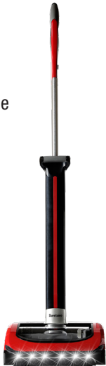
TRACER™ Cordless Vacuum MFG # SC7100A