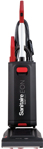
EON® QuietClean® Upright Vacuum MFG # SC5500B

*Based on ASTM F2607 testing of the SC5500B & SC5500A